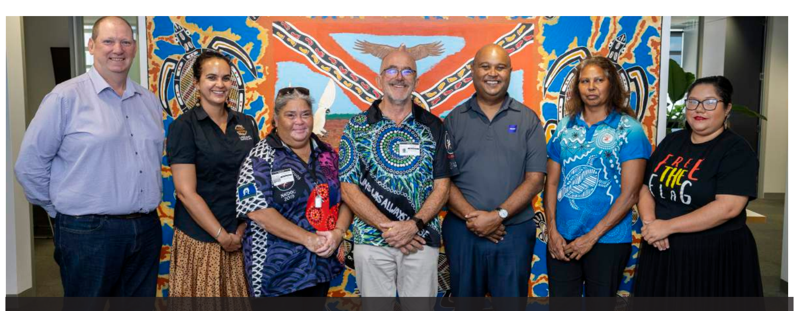
Celebrating commissioning of local Larrakia artwork at INPEX Darwin office with representatives from the Larrakia Nation Aboriginal Corporation.