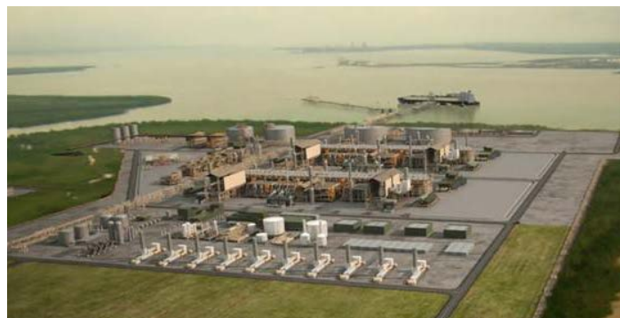
Ichthys LNG Plant, Darwin (image)