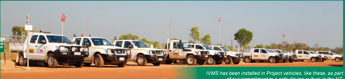
IVMS has been installed in Project vehicles, like these, as part of our commitment to a safe driving culture in the NT.

Last edition we talked about transporting the Project's construction workforce using buses. With people now moving into the village, buses are starting to take first residents to and from Blaydin Point, park and ride facilities, the airport and local amenities.