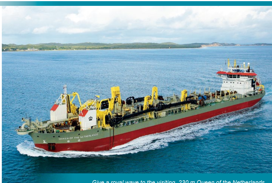
Give a royal wave to the visiting, 230 m Queen of the Netherlands.

We'll be talking to the community about these activities soon, but in the meantime we'd like to welcome back the Queen of the Netherlands, a trailing suction hopper dredger. You'll be seeing a lot more of her and her entourage (two backhoe dredgers and four split hopper barges) in the coming weeks and months, along with other vessels.