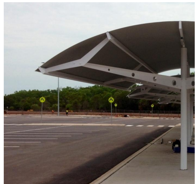
The Darwin Airport park'n'ride will begin operating from Monday, allowing workers to park their vehicles at a central location, before being collected by Project buses.

Please continue to help us safely share our roads.