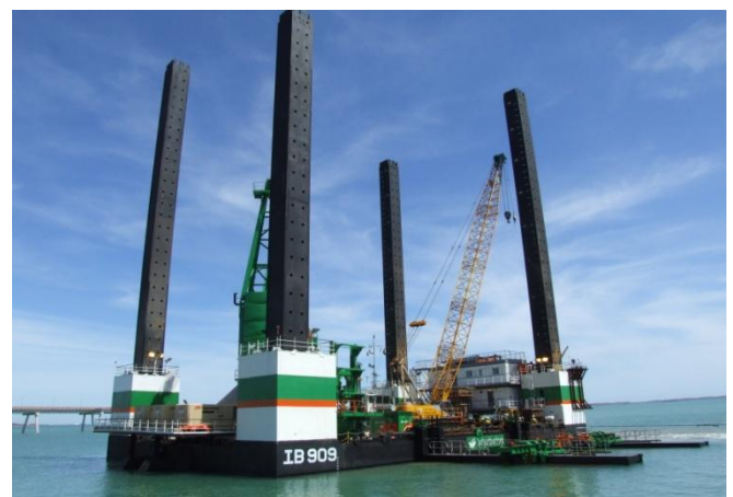
A jack-up barge which will be used in marine construction