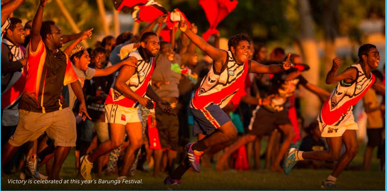
Victory is celebrated at this year's Barunga Festival.