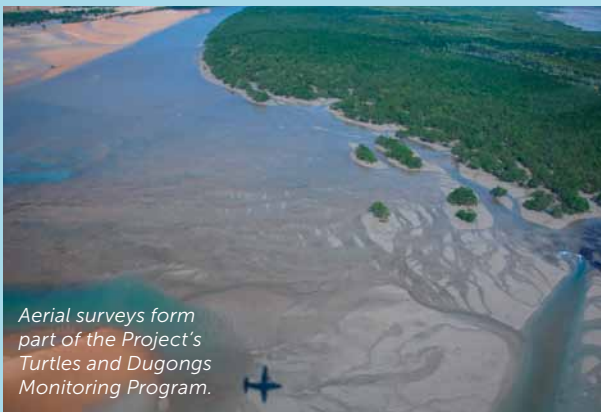
Aerial surveys form part of the Project's Turtles and Dugongs Monitoring Program.

Though you will have likely noticed the absence of our dredging fleet, the Project has an ongoing commitment to monitor the Darwin Harbour environment and you will continue to see our environmental scientists working on and around the water.