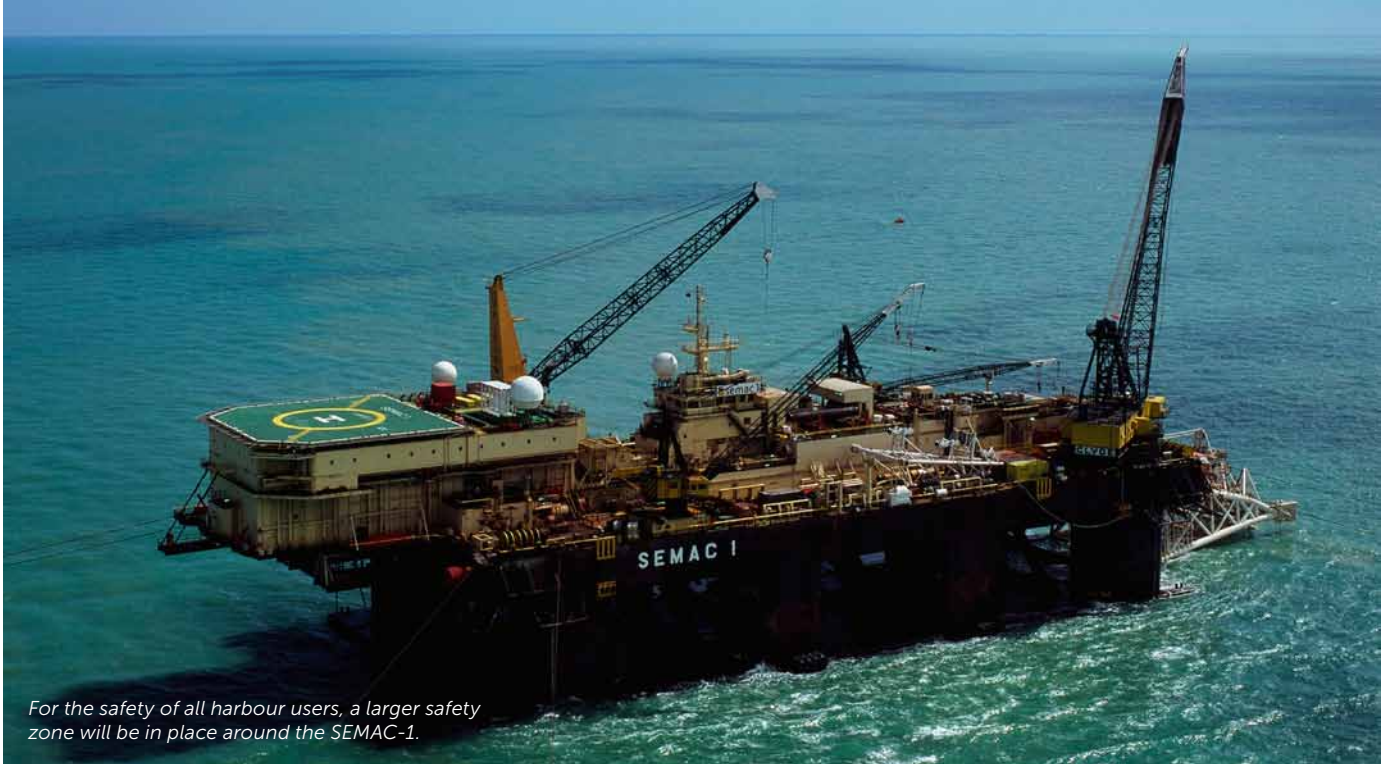
For the safety of all harbour users, a larger safety zone will be in place around the SEMAC-1.