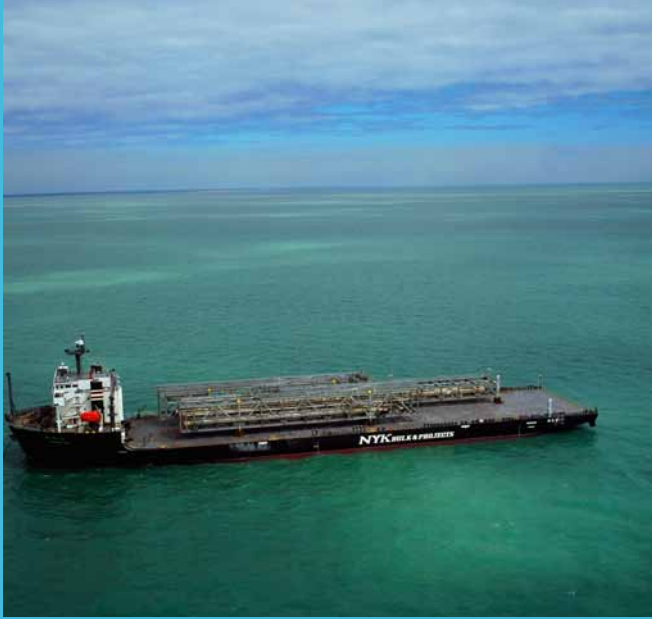
The Project's first large modules have arrived in Darwin.

The Project is preparing for the next phase of its construction effort in Darwin, following the arrival of its first large pre-fabricated modules. The modules will be used to construct the Project's LNG processing facilities at Bladin Point.