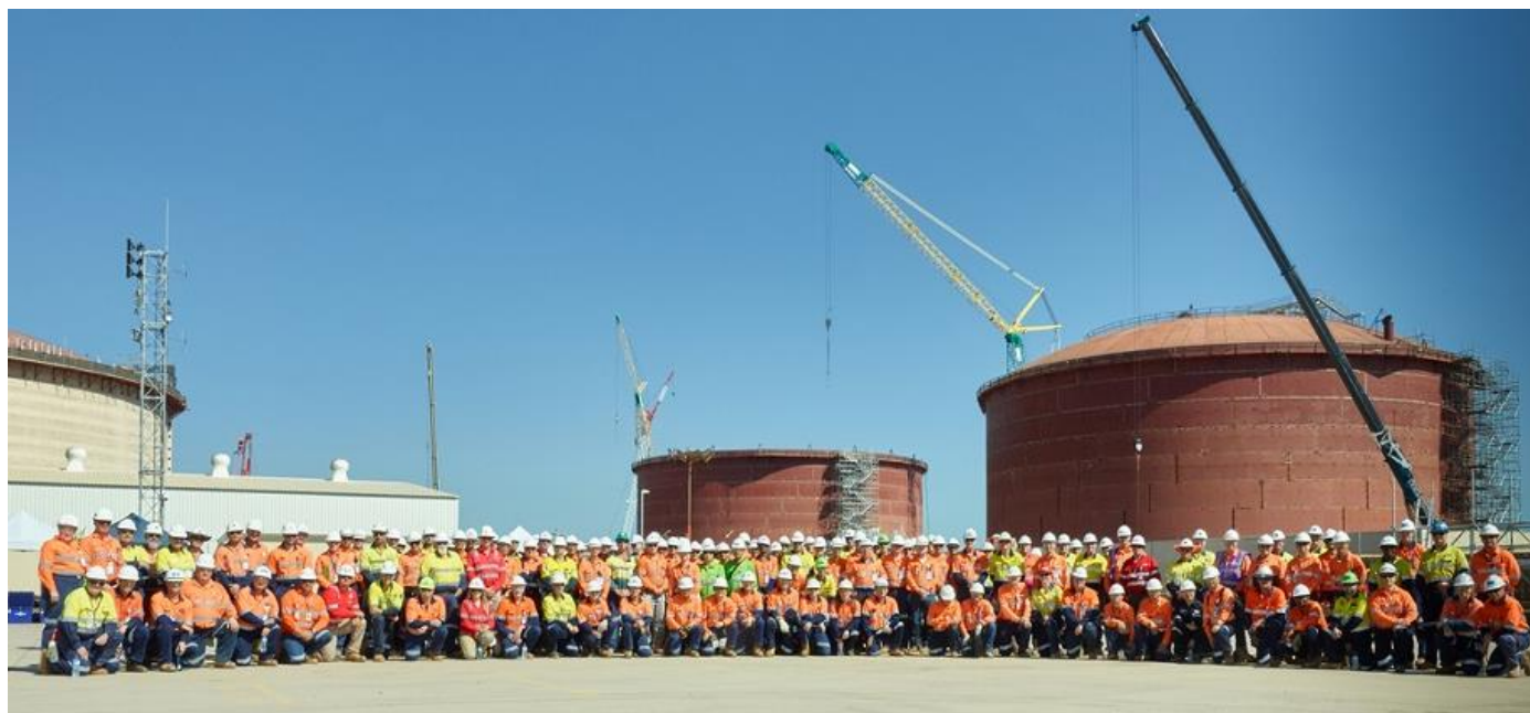
The HSE forum delegates gather outside after a morning of onsite workshops and planning sessions.