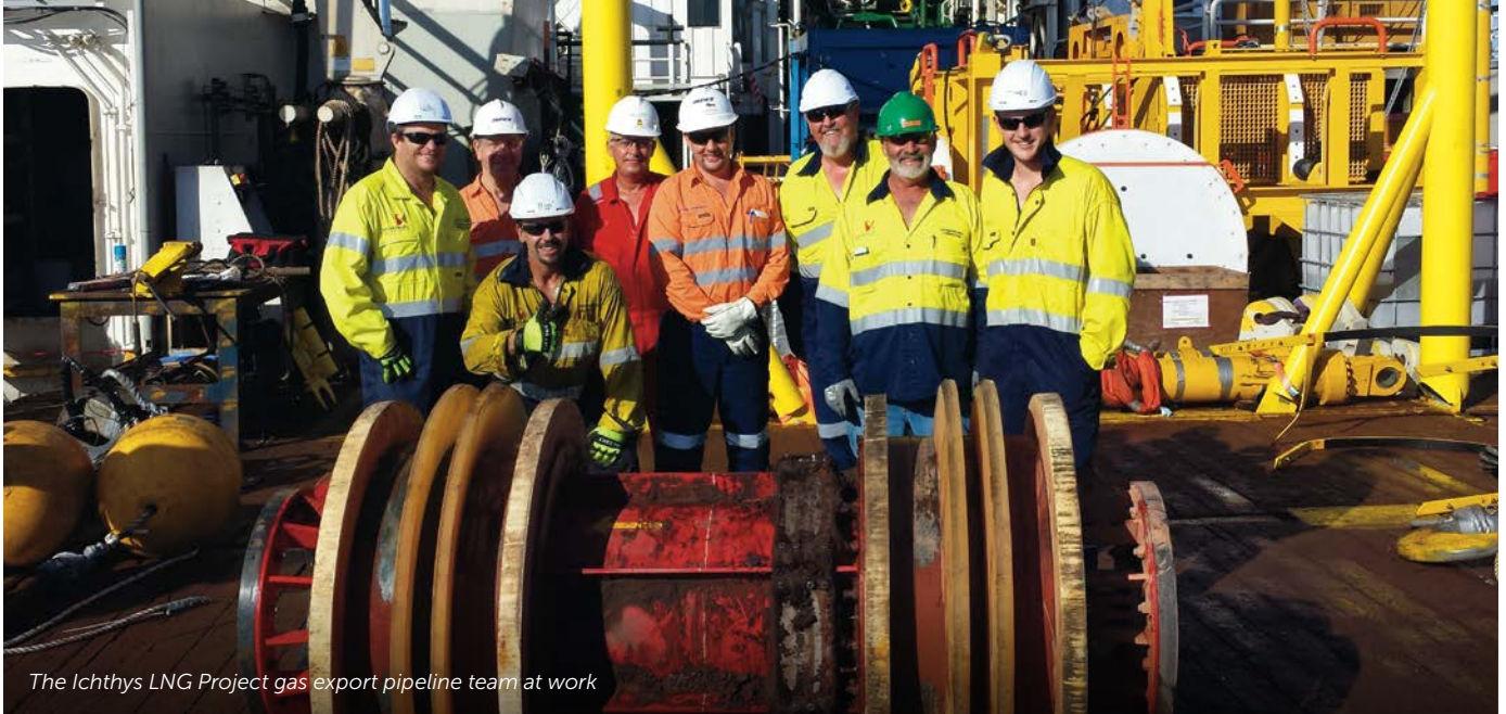
The Ichthys LNG Project gas export pipeline team at work