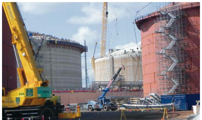
There are six product storage tanks on site for LNG, propane, butane and condensate.