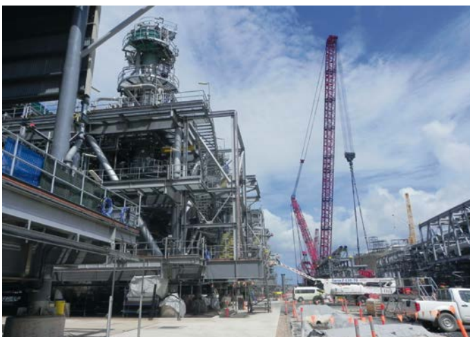
The inlet facilities are the entry point for raw gas flowing into the gas treatment facility.