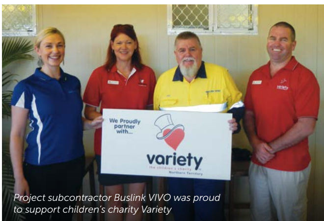
Project subcontractor Buslink VIVO was proud to support children's charity Variety

More than 4000 people took part in this year's Australia Day Fun Run in Darwin