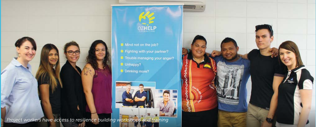
Project workers have access to resilience building workshops and training