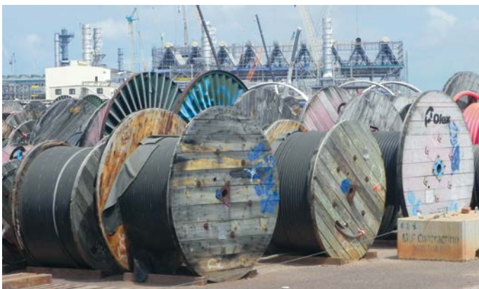
More than 6000 kilometres of cables are being installed at Bladin Point.