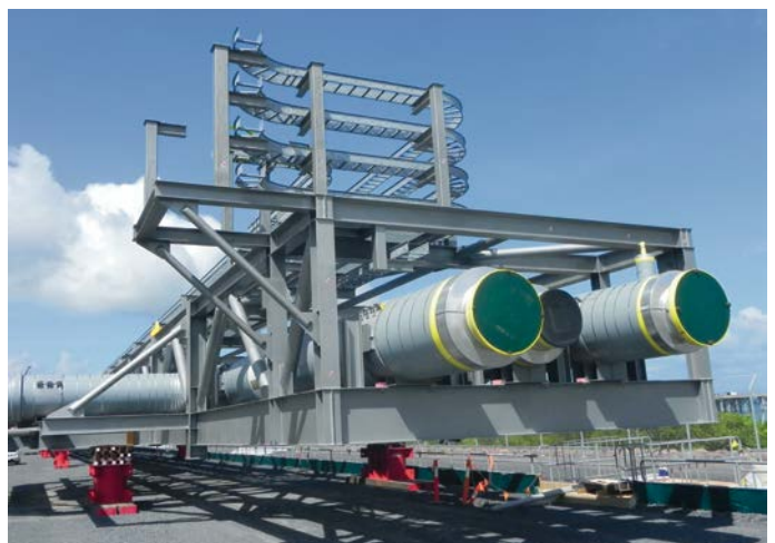
These pipes will carry propane across the product loading jetty for export by vessel.